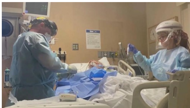
Covid-19 Hospital Response

We have seen much devastation and tragedy throughout our world today. Let us have the mind of Christ Pray and give to those in need