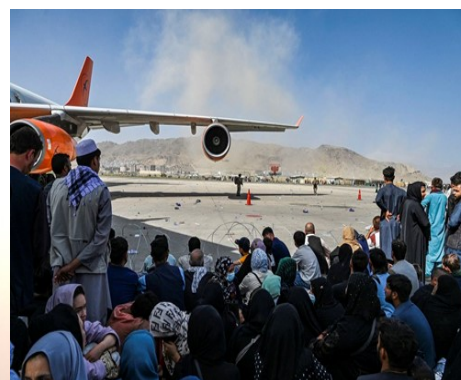
Air Lift Afghanistan

Disaster Relief Offering throughout September