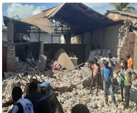
Earthquake in Haiti