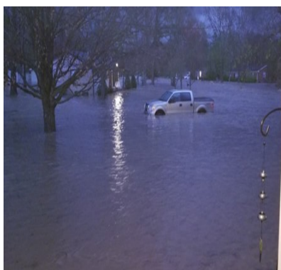
Flooding in Tennessee